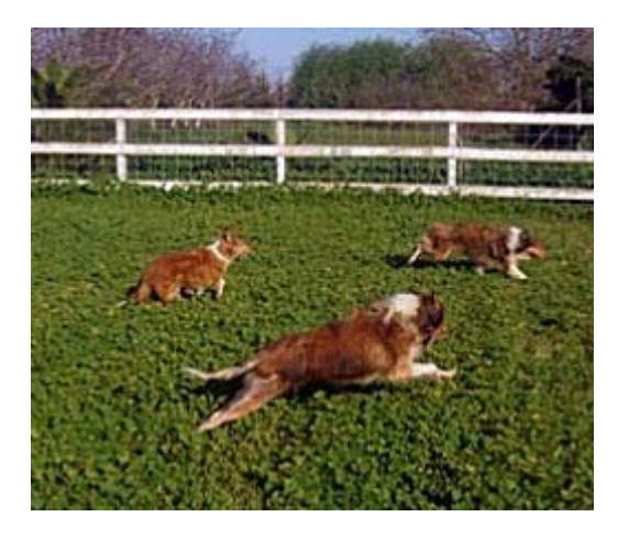
Camelots enjoy their first run after 5 weeks in isolation.

care so Animal Control took the dogs into custody. Lancelot, Lady, and Guinevere were diagnosed with sarcoptic mange, which is highly contagious to other dogs and people and can take months to cure. If NCR hadn't stepped in, Animal Control planned to euthanize all three dogs in two days.