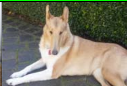
LUCY aka PENNY