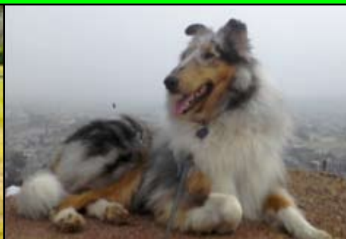
BARKLEY aka BENTLEY