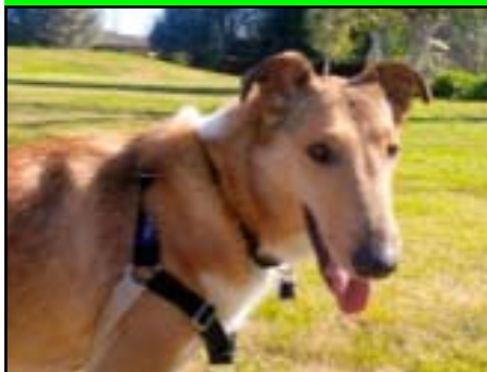
MERCY aka DOTTIE