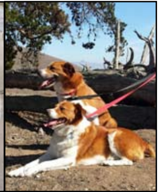
Sundance & Cassidy